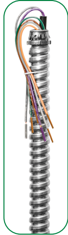
Illumination Control Fixture Whips