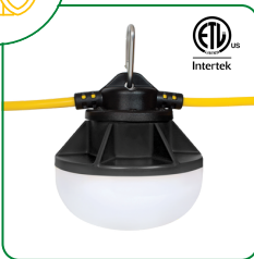
High Lumen Output LED CordLight 20,000 Lumens P/N 16050