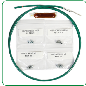
Ground Bonding Jumper Kit P/N EGBP-06-72-00-S