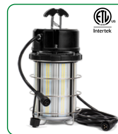
TIGER XL 100-watt Dual Rated 120-277V 15,000 Lumens P/N 15738