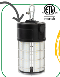
TIGRESS Prefab 100-watt Dual Rated 120-277V 15,000 Lumens P/N 15742

INFINITELY CONFIGURABLE AND IDEAL FOR ANY JOB SITE!