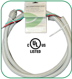
Air Conditioner Whips P/N ACWNM1063-1RA