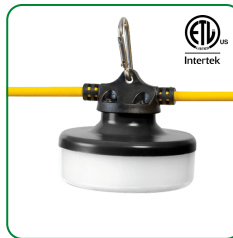
LED CordLights 15,000 Lumens P/Ns 16140 & 16145