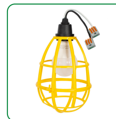
Single Lamp Light Kit P/N 16024 & 16025