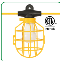
Economy CordLight P/N 16400 & 16410