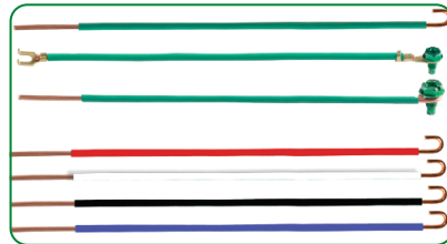
Grounding PigTails and PowerTails