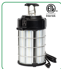
TIGERcub 150-watt 22,500 Lumens P/N 15723