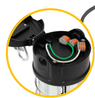
3-Conductor Lever Nut Connectors